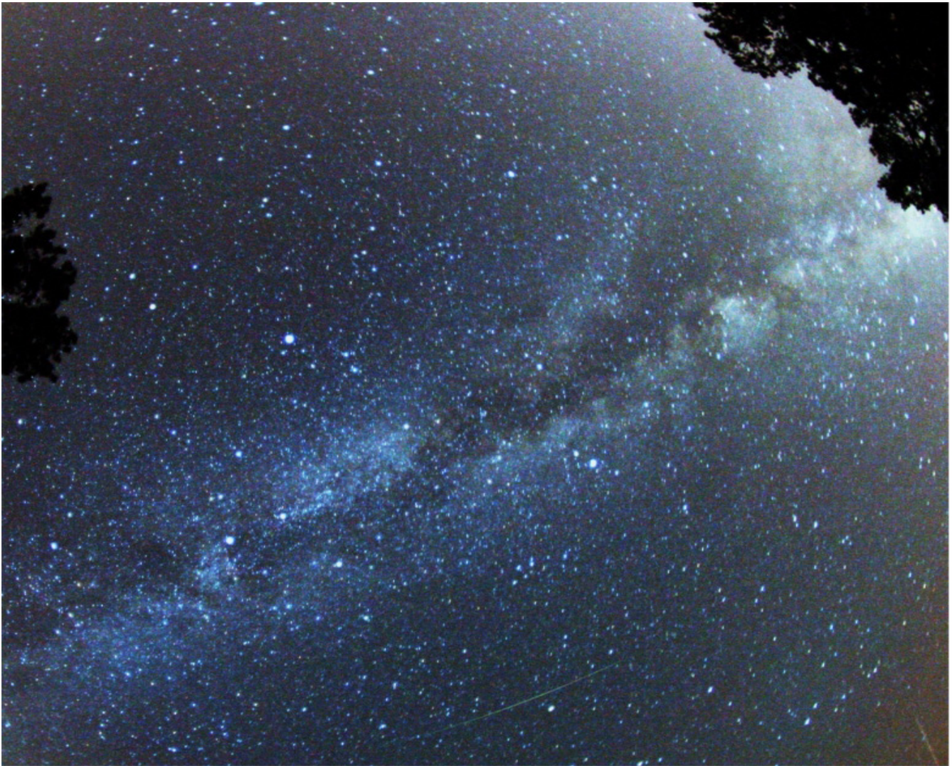
The Milky Way, time lapse photography with 13 minutes exposure

Later, as the sky darkened indigo and shining with stars, we all settled comfortably into hammocks or lay on the large flagstones, sinking upwardly against gravity into the canopy of the phenomenally visible cosmos.